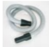
Standard treatment hose